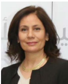
H. E. En. Hala Zawati, Minister of Energy and Mineral Resources, Jordan

He subsequently held positions at World Bank Institute, the Middle East/North Africa Region, Finance and Private Sector Development in Africa, and most recently was Country Director for seven countries in Southern Africa (South Africa, Botswana, Eswatini, Lesotho, Namibia, Zambia and Zimbabwe).